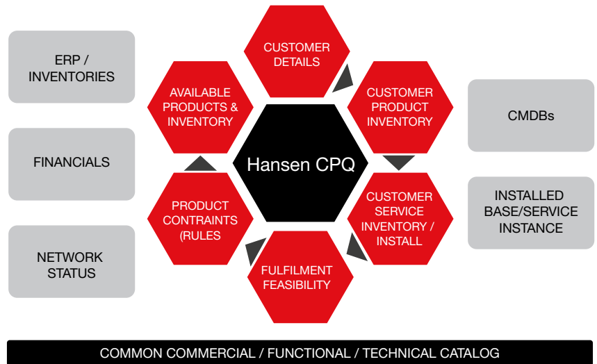
Hansen CPQ in the Context of Sales Systems and Processes

Pre-integrated with the Hansen Catalog that defines the product portfolio, Hansen CPQ ensures consistency across the sales function and across all sales channels. Validated from the moment a quote is formed and captured as a digital order, Hansen CPQ minimizes costly order fallout and rework – good for the enterprise and the customer too. Hansen CPQ works closely with supporting sales systems and processes, like Hansen CIS, Microsoft Dynamics 365, Salesforce and Oracle Siebel. CSRs, sales people and customers are guided through options which recognize product and service rules and the customer's existing service context, so incompatible elements are never offered.