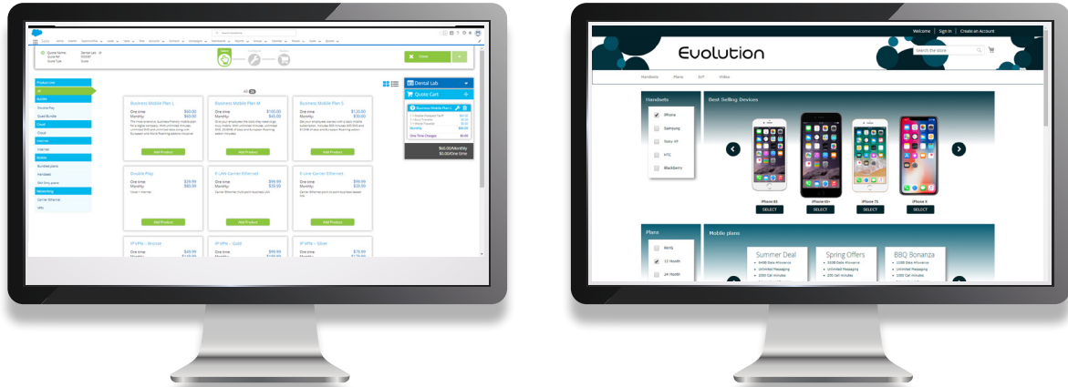
Hansen CPQ within Salesforces and Supporting E-Commerce Deployment