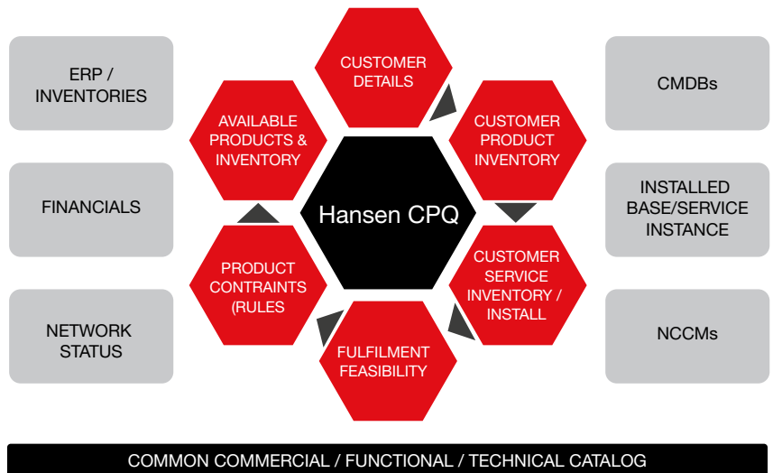
Hansen CPQ in the Context of Sales Systems and Processes

Hansen CPQ works closely with supporting sales systems and processes, like Microsoft Dynamics 365, Salesforce and Oracle Siebel. CSRs, sales people and customers are guided through options which recognize product and service rules and the customer's existing service context, so incompatible elements are never offered.