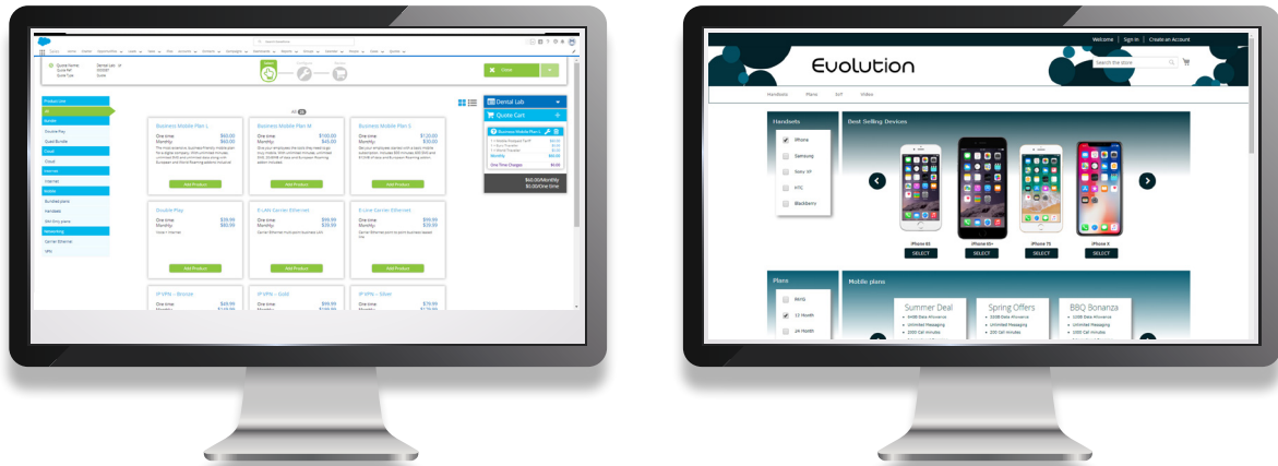
Hansen CPQ within Salesforce and Supporting E-Commerce Deployment